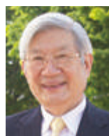
五百旗頭 真 Makoto Iokibe 国際防災・人道支援協議会 (DRA) 会長／ (公財) ひょうご震災記念21世紀研究機構理事長 Chairperson, Disaster Reduction Alliance (DRA) / President, Hyogo Earthquake Memorial 21st Century Research Institute